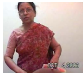
Oct 4, 2003

less, and she would lie in bed, wracked by arthritis, unable to even read a book or newspaper. She simply wasn't motivated to do anything.