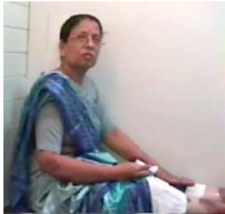
Sept 20, 2003

A depressed, middle-aged woman suffering from multiple and chronic ailments approached MindHeal Homeopathy in September 2003.